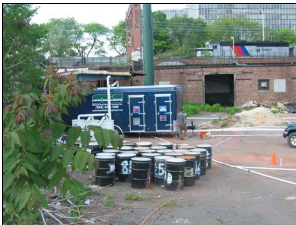
TPVE system in operation during summer 2005.

AES then conducted a two-phased vacuum extraction program (TPVE) to remove TCE from soil and shallow groundwater. For six months, AES operated a leased trailer-mounted vacuum extraction unit with activated carbon vapor treatment. After achieving maximum benefit, AES demobilized the vacuum extraction system. By comparing pre-TPVE and post-TPVE soil TCE concentrations, the vacuum extraction removed an estimated 90% of the TCE in soil. The 2005 catch basin cleanout and two phase vacuum extraction lowered the groundwater TCE approximately 86% in the source area monitoring well.