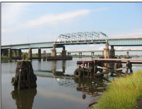
One New Jersey study site, estuary in foreground.

The goal of the water level monitoring was to measure the degree of tidal influence on groundwater gradients. Most projects also included slug testing to measure the hydraulic conductivity at tested monitoring wells. Mr. Varner used AES pressure transducers and data loggers to collect the hydraulic data and specialized software to reduce the data.